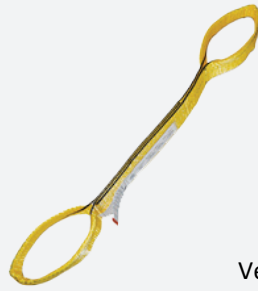
Vertical Eye to Eye